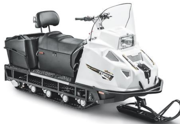
STELS 600L Mopoz