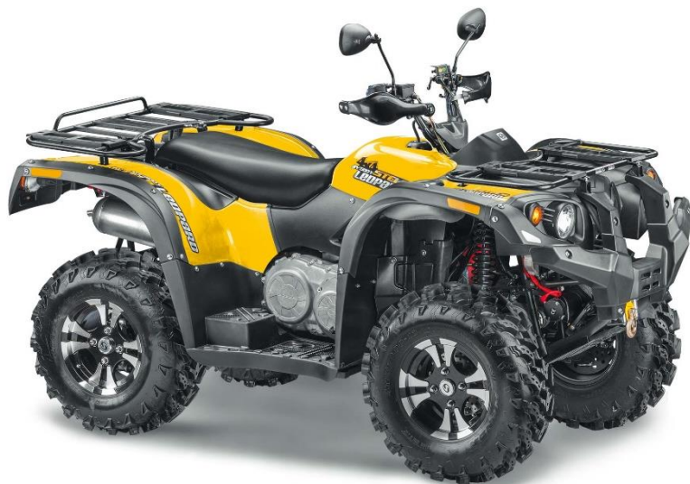
STELS ATV 500YS LEOPARD