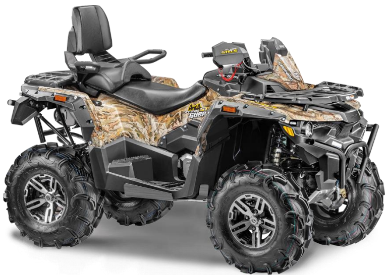
STELS ATV 850G GUEPARD Trophy EPS