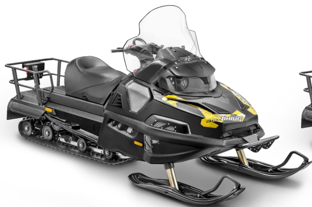
STELS S600 Viking