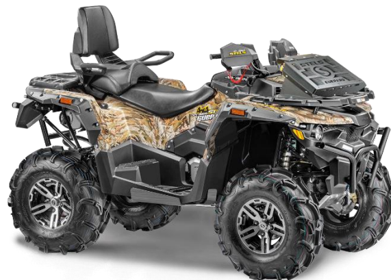
STELS ATV 800G GUEPARD Trophy PRO