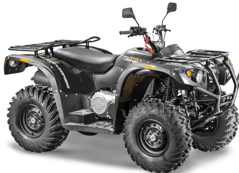
STELS ATV 500YS ST LEOPARD