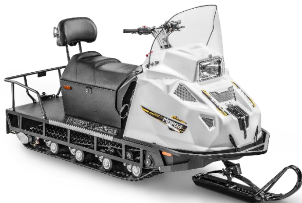
STELS 600S Mopoz