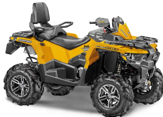
STELS ATV 800G GUEPARD Touring