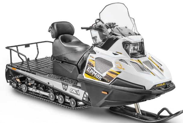
STELS 800L Epmax