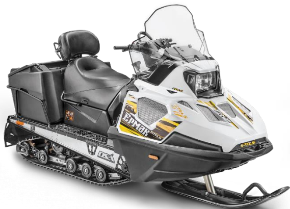
STELS 600S Epmax