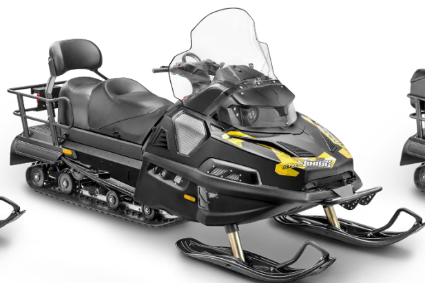
STELS S600 Viking ST