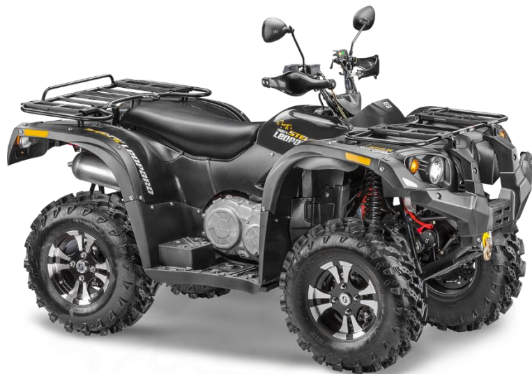
STELS ATV 650YS EFI LEOPARD