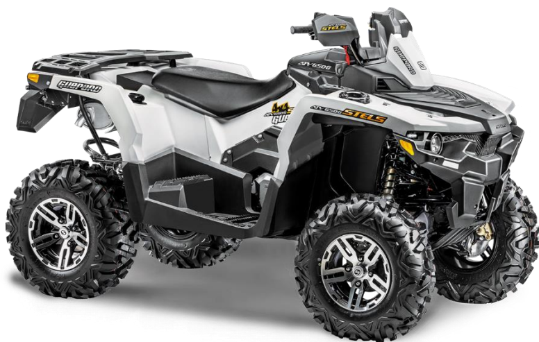
STELS ATV 650 GUEPARD ST