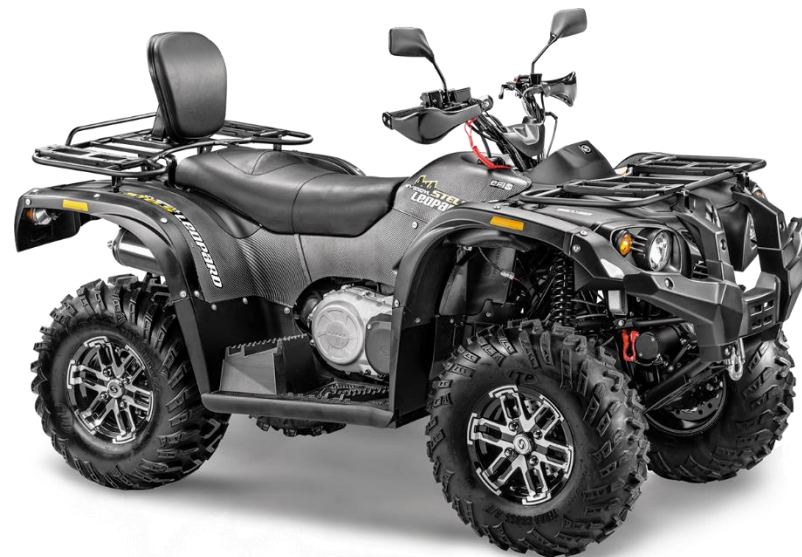
STELS ATV 650YL EFI LEOPARD