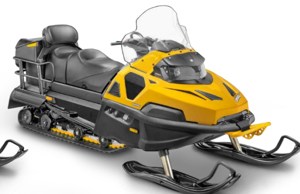
STELS V800 Viking