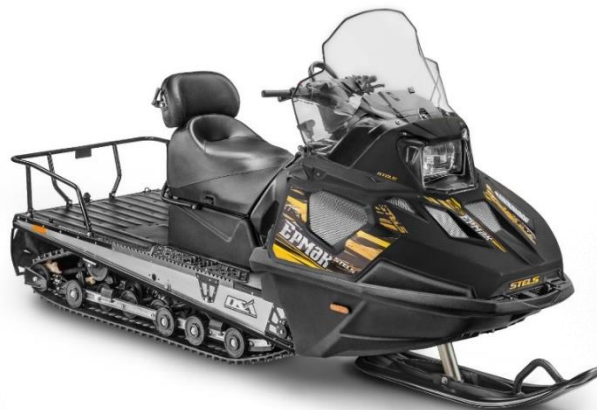
STELS 600L Epmax